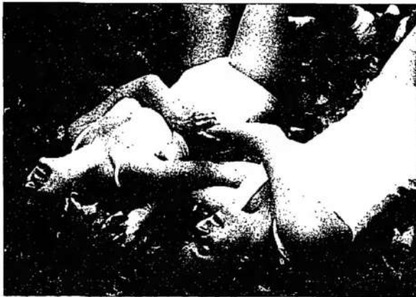
Gateway through the clouds: Heavenly Creatures was the film which raised the question once more: what happened to New Zealand's notorious 'gym-tunic murderesses'? It depicted their fantasy-filled friendship with what seemed to be great authenticity

When the police found Pauline's diary open where she had left it in her room, the truth began to sink in. The girls gave conflicting interviews to detectives, but Pauline was taken into custody late that evening. Juliet was arrested next day. Anne